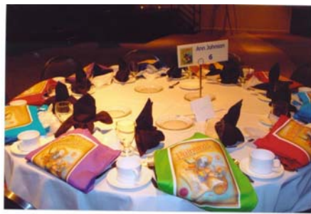
Windy Brushes Table