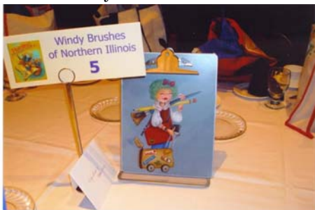
Windy Brushes Table