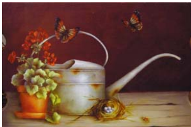
Geraniums and watering can (Jansen Acrylics used on Projects)