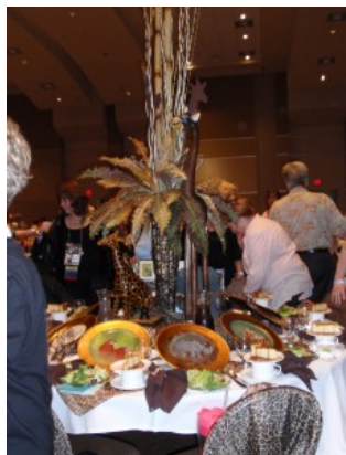
1st Place - Indy Decorative Painters Jungle Table