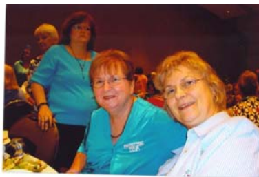
IPP Members celebrating at the Banquet