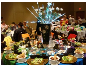
2nd Place - Sandy Scales' Color Wheel Table