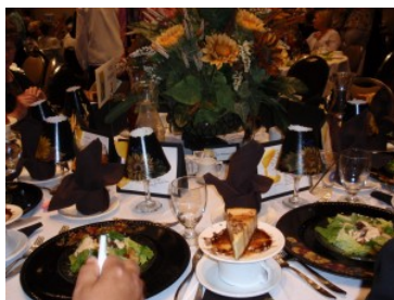
3rd Place - Kansas Wheathearts' Sunflower Table