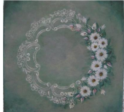
Sunday, April 18