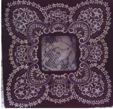
Friday, April 16

Check-in 8:30A.M. - Class 9:00 A.M. - 5:00 P.M.