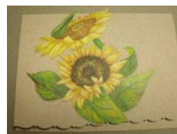
Sunflower Colored Pencil By Nancy Simpson

Mi Teintes Paper: 8 ½ X 11 "Moonstone" White Transfer paper Backer board Eraser Hand held pencil sharpener