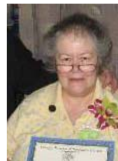
Project TBD due to Darlene' Neuman's passing